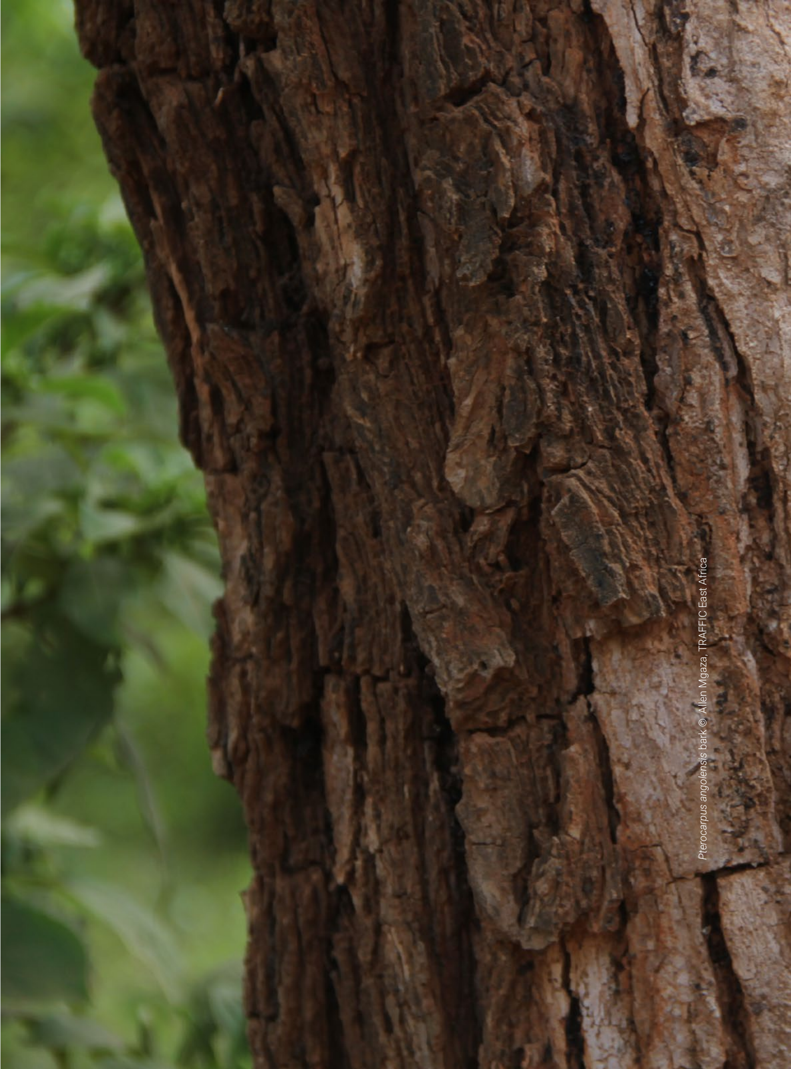
Pterocarpus angolensis bark