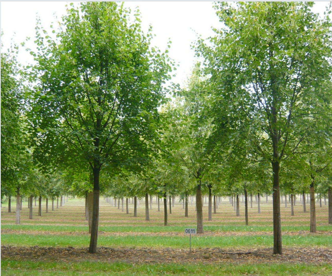
Pine Pinus spp. , Plantation in Njombe, Tanzania

Tanzania produces significant amount of plantation timber annually. Most common species are Pinus spp. , Eucalyptus spp. , wattle ( Acacia mearnsii ) and teak . The timber originates both from small and larger private, and government owned plantations, the hotspot for plantation timber production being the Southern Highlands.