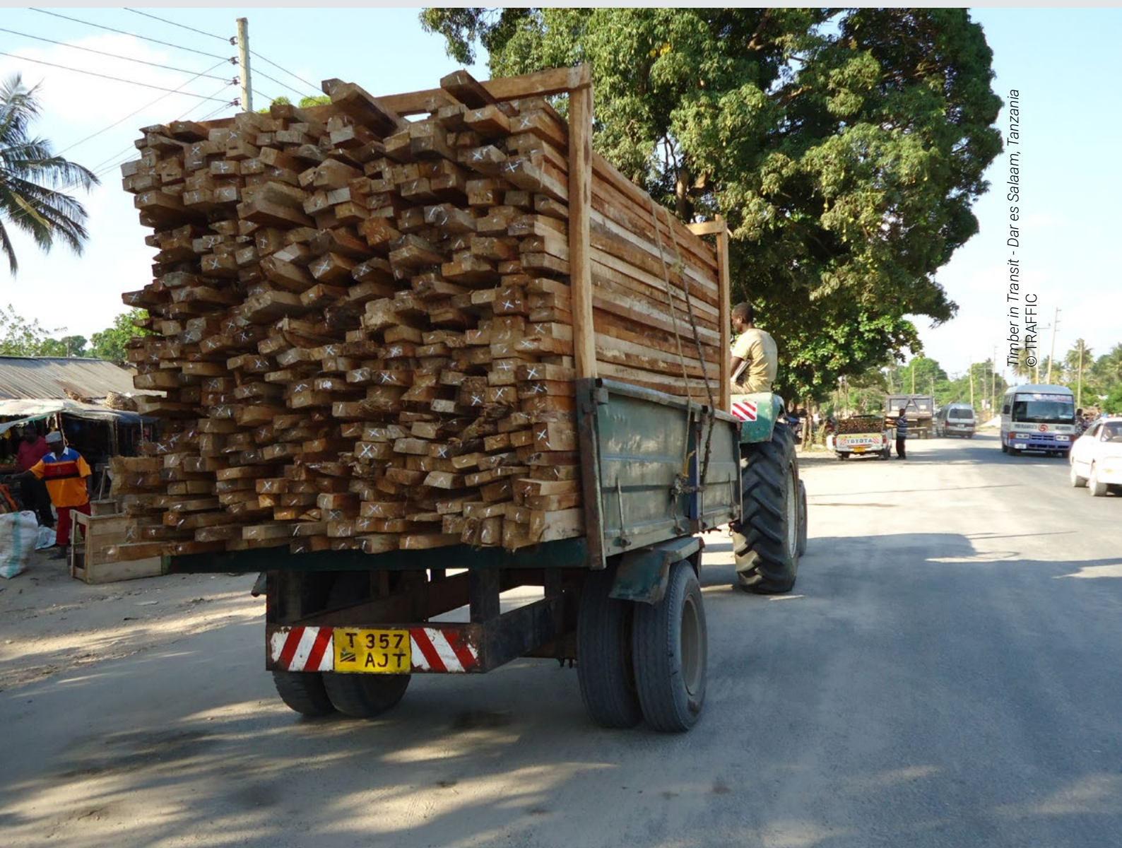
Timber in Transit - Dar es Salaam, Tanzania

NBS (2021), Tanzania in Figures , National Bureau of Statistics, Ministry of Finance and Planning, The United Republic of Tanzania.